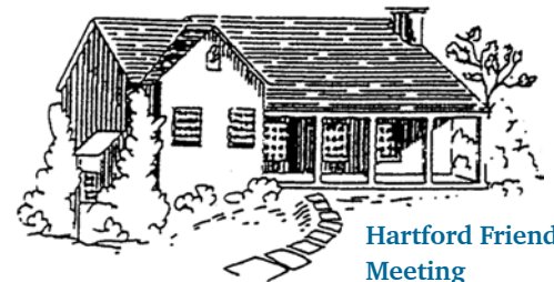
Hartford Friends Meeting

Hartford (CT) MM in a called meeting for worship for business united on a project to upgrade accessibility to their meetinghouse by installing a lift between the buildings two floors. The meeting was presented with two options, a less expensive solution at the rear of the building and a more expensive option at the front of the building. Out of a gathered period of worship, the meeting chose the more expensive option, affirming the “desire and commitment to welcome all Friends both in words and in the unwritten message [by] providing a central, safe entrance for the lift.” ❖